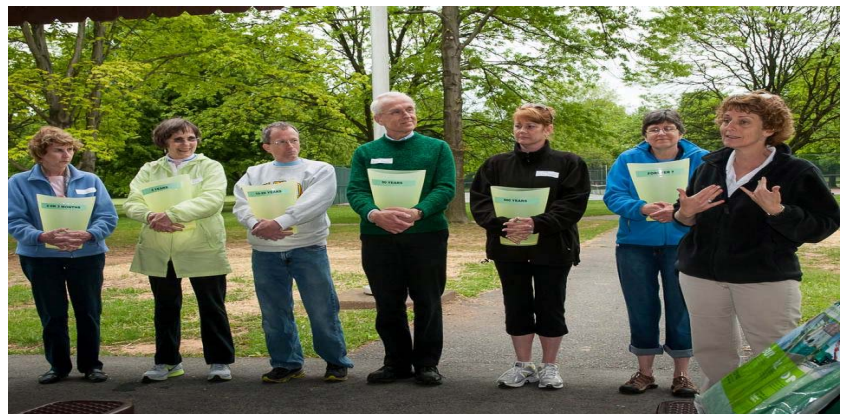
Residents play an interactive game to learn about decomposition