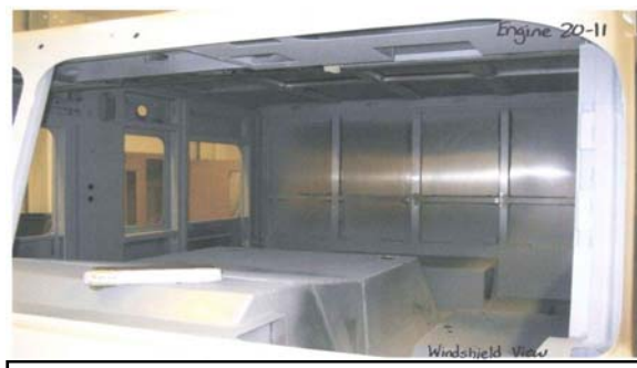
Windshield Interior View: Engine 20-11 under construction