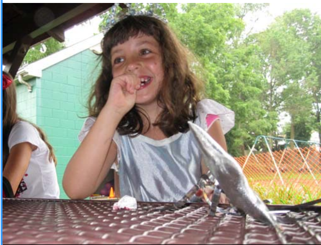
More fun on Halloween Day at Green Acres Park