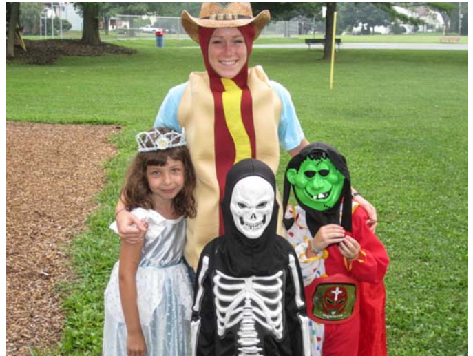
Halloween Day at Green Acres Park

before the program begins, registration forms can be found on the Salisbury Township website or picked up at the parks.