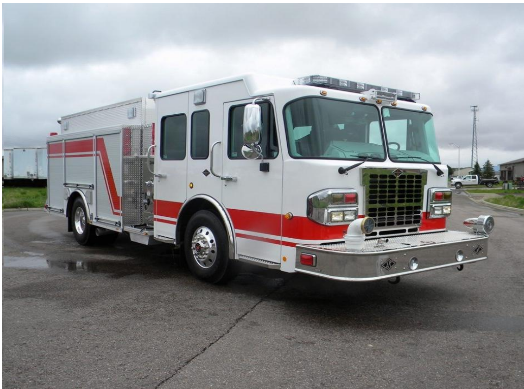
The completed truck awaits outfitting before delivery