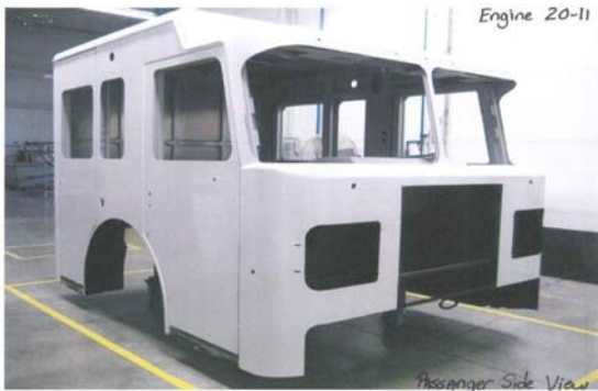
Passenger Side View: Engine 20-11 under construction