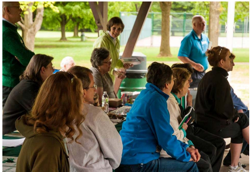
Residents listen to a presentation