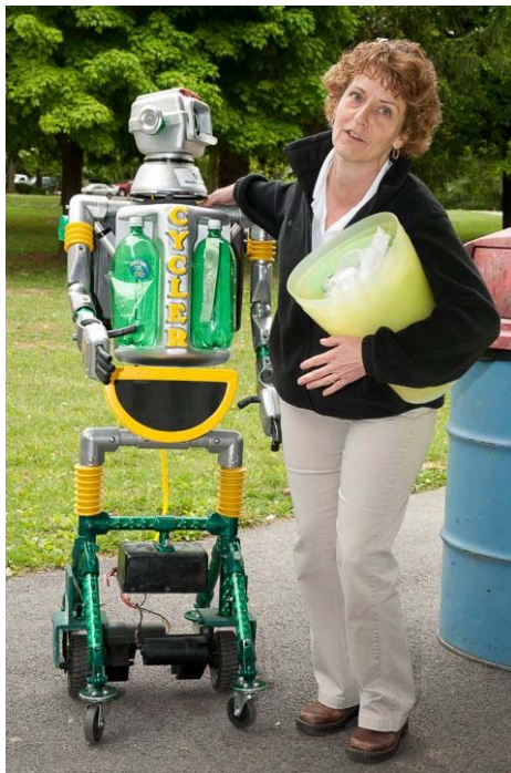
Cycler the Robot helps Waste Management teach about recycling